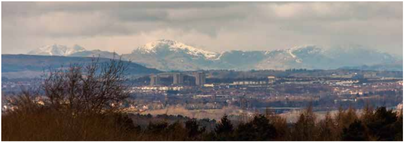
View from the Monkey Road

A new series of walking trails has been launched in the Clyde Valley to help people get more active, provide better connectivity between communities, neighbouring settlements and the Clyde Walkway and to help people find out more about the landscape and heritage of the area.