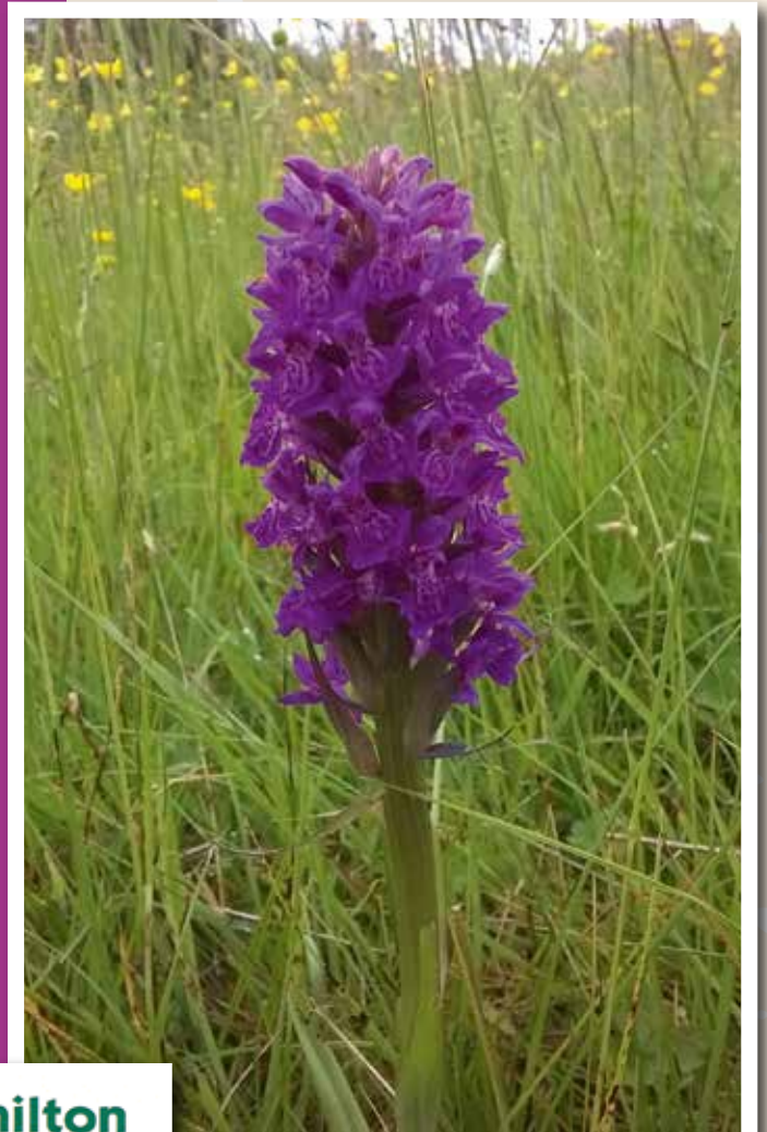
Northern marsh orchid

The book can be ordered from www.naturebureau.co.uk/