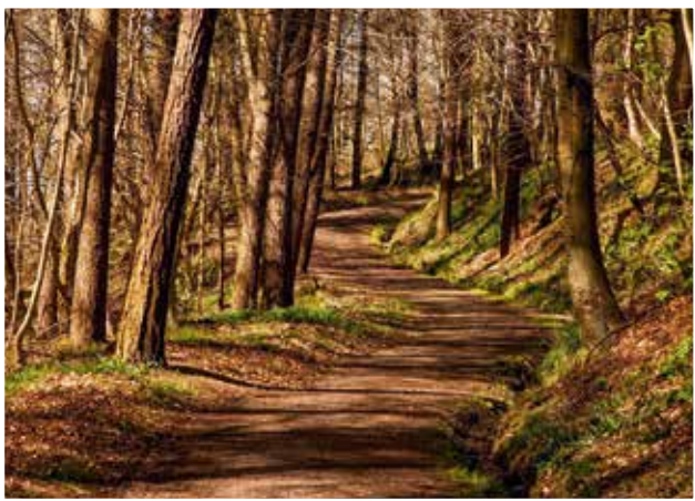
Law to Mauldsie

The main aim behind the project was to improve the outdoor access network through both enhancing footpath linkages between a number of settlements lying in the Clyde and Avon Valley Partnership area, and developing local links with the Clyde Walkway; the main strategic long distance access route running through the area. The capital work funded