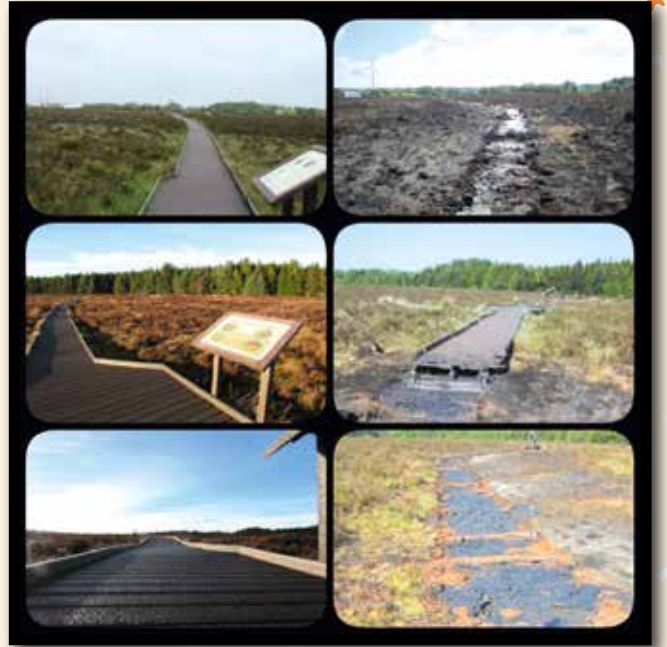
The boardwalk at Langlands before and after fire damage

On Saturday, 4th June a large group of local people assisted by SLC's Countryside and Greenspace team, Community Payback and SLC Land Services removed the melted plastic from the fragile surface of the bog. The damaged material removed filled three lorries!