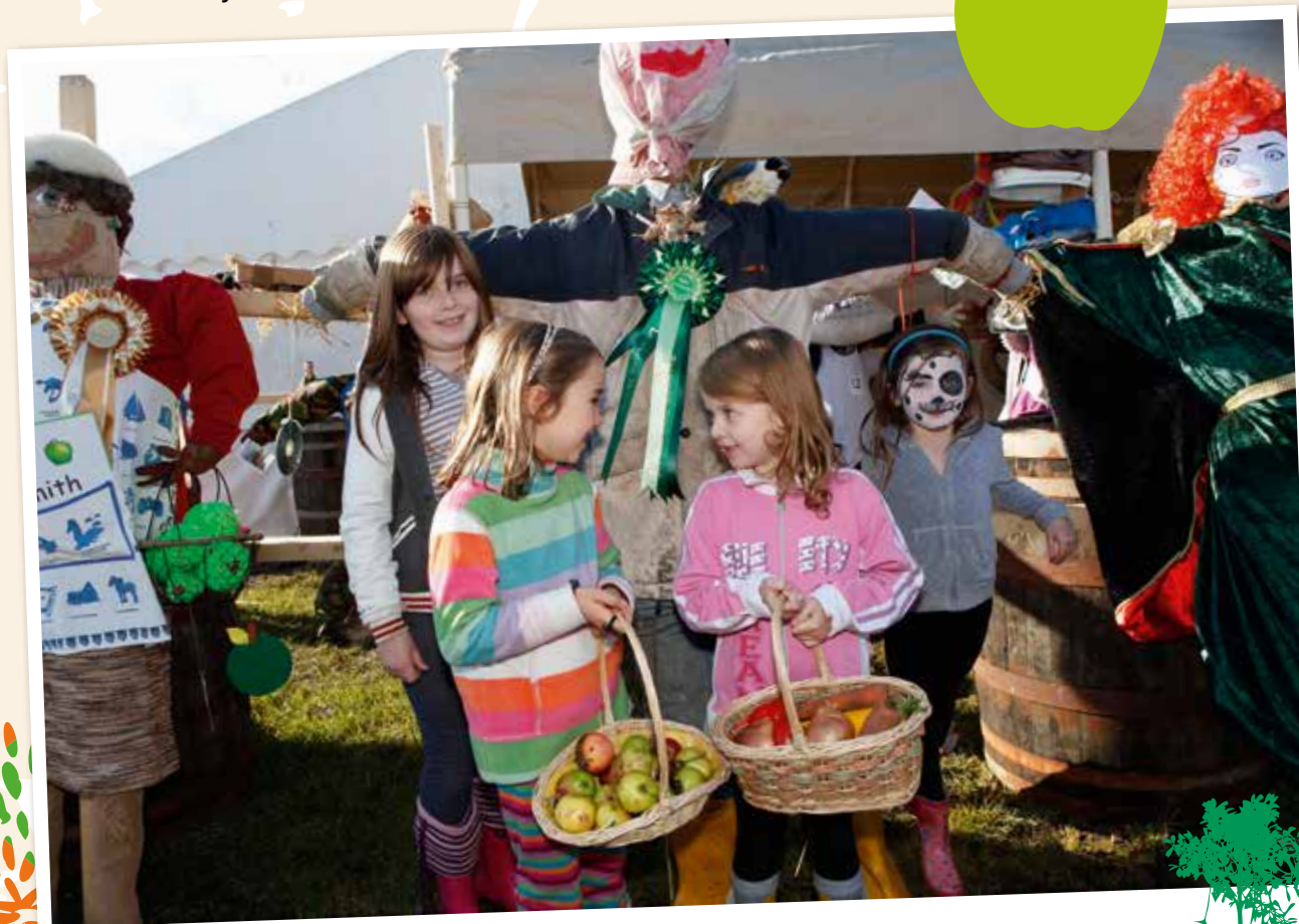
Clyde Valley Fruit Day