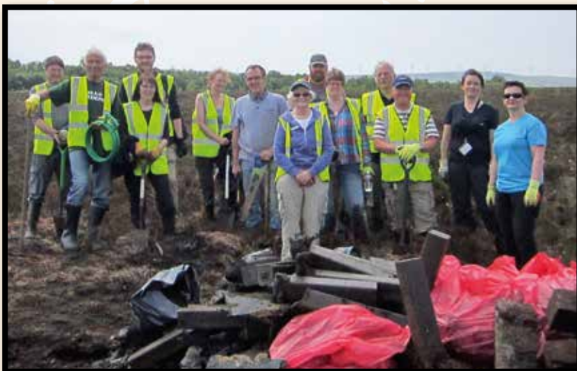
FOLM and volunteers clearing up the damaged boardwalk

The Friends are now back in the position of fund raising to replace the damaged boardwalk; damage is estimated at £30,000. We have already set up a fund raising page: – www.gofundme.com/27t7mng and have received donations from Moss users and friends. We have a folk concert planned for 8th October in the Murray Owen Centre in East Kilbride. We would appreciate support at all levels from residents and staff in South Lanarkshire Council.