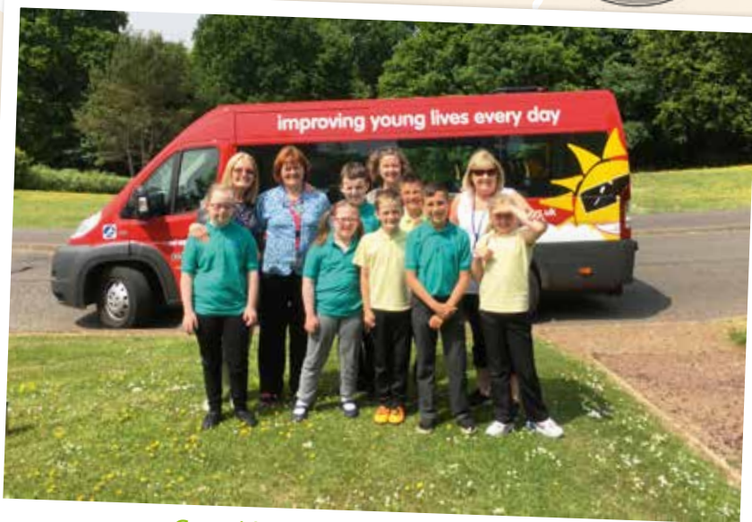
Greenhills Primary School visit the site