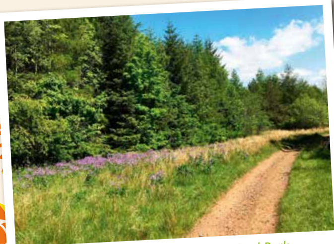
The community woodland at Peel Park