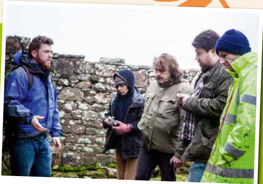
CAVLP Heritage Volunteers

Contact cavlp.heritage@gmail.com or phone 01555 661 555 to find out more or to get involved.